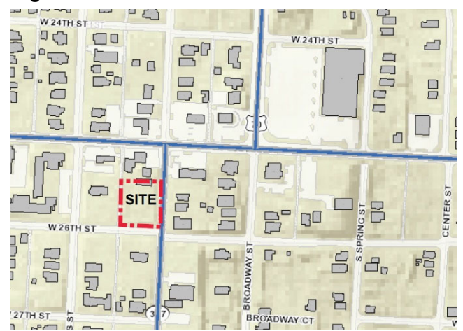
Figure 3. Master Street Plan

The primary function of a Principal Arterials is to serve through traffic and to connect major traffic generators or activity centers within an urbanized area. Lower design standards are required for Principal Arterials compared to